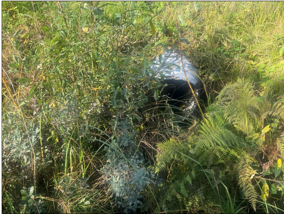
Figure 3.—Culvert upstream of the road.