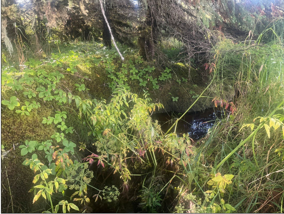
Figure 2.—Channel downstream of the culvert.