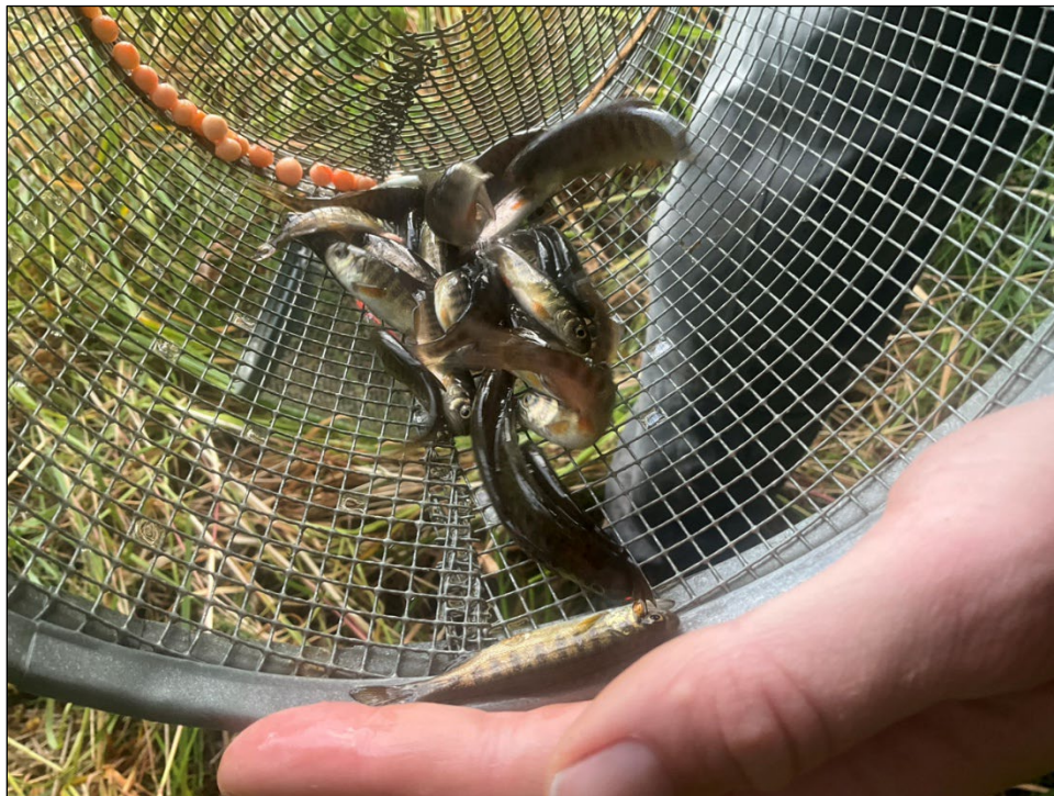
Figure 1.—Juvenile coho salmon captured at waypoint 1275